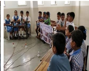
Mini Science Centre Teacher Training Program Science Competition Monitoring & Evaluation